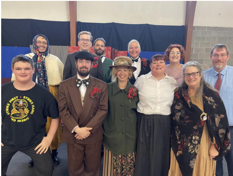
Cast of the Gift of the Magi

Marshalltown Community Theater (MCT): In the wake of the very successful performance of The Gift of the Magi in our Great Hall in early December, the Vestry met with members of the Board of MCT on December 27, to discuss the possibility of fostering on-going relationship. The discussion was lively and centered around St. Paul's providing office and storage space as well as being a venue for future auditions, rehearsals, and productions. The Vestry has proposed a 90-day contract at $600 so the MCT can hold auditions and rehearsals for a one-act play to be performed early in 2022. MCT will be bringing our proposal to their full board for a decision soon.